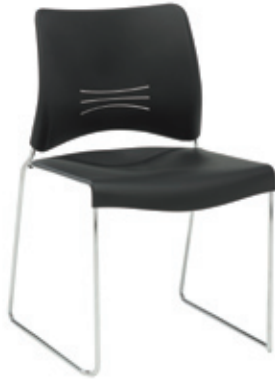
2410-30 Very Black