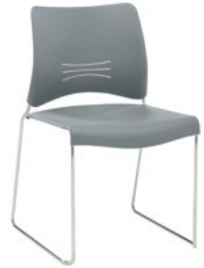
2410-31 Medium Grey