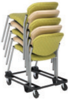
Stacks up to 5 high on dolly.