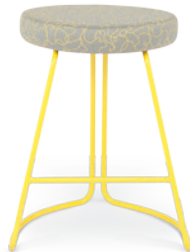
17" high, sunshine frame finish.