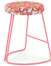
17" high, pink flamingo frame finish.