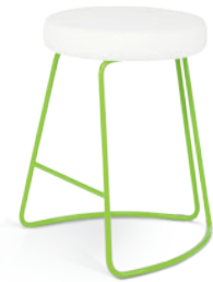
17" high, granny smith frame finish.